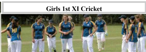
Girls 1st XI Cricket