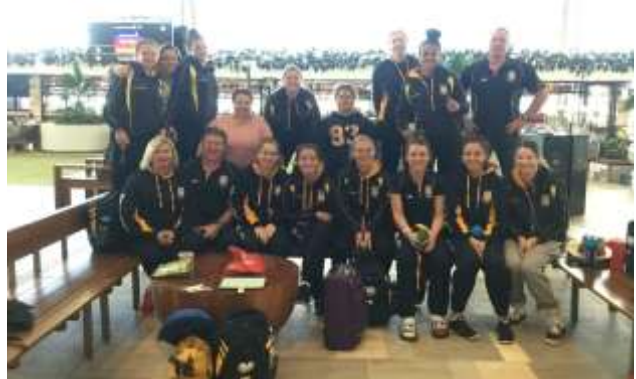
In the July school holidays we had a netball team travel to Australia to participate in the Gold Coast Netball Carnival. The tournament was a fantastic experience for all involved.

Netball finals are Saturday 1st September—good luck to all teams!