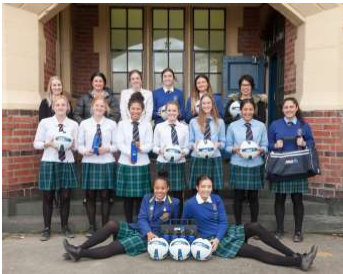
Senior A LNISS Netball Squad receiving new gear from ANZ. A huge thank you to ANZ for the bottles, balls and bags.